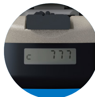
Smart cleave counter