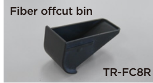
Fiber offcut bin