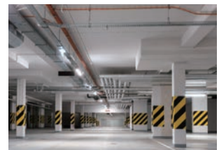
Parking Lot Entrance