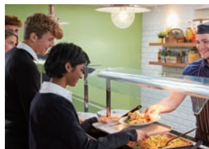
Food Court Entrance